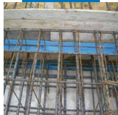
Sealing a structural joint on foundation

All relevant references for the product are available upon request and from www.mapei.com