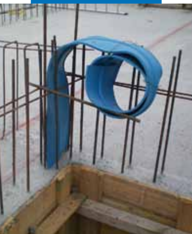
Structural joints in a wall with a PVC profile embedded in the foundation pad after casting