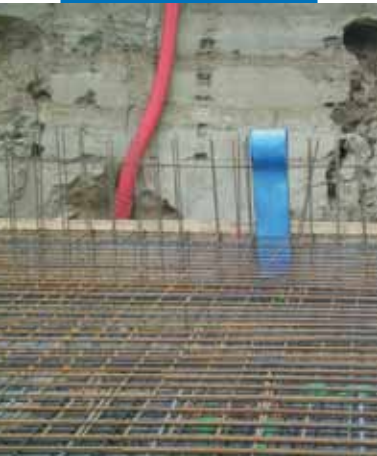
Structural joints in a wall with a PVC profile embedded in the foundation pad before casting

forms a perfect bond. As with embedded joints, insert a suitable type of compressible material between the first and second cast of concrete to form the joint and to avoid that this one is clogged by a rigid material.