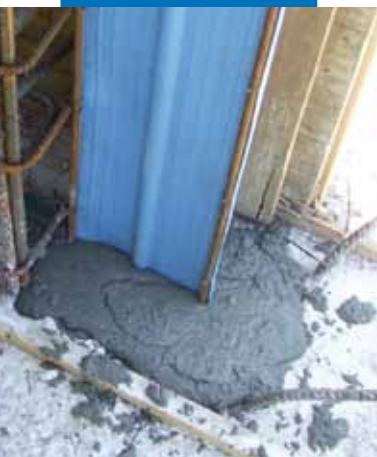
Idrostop PVC BI embedded in the foundation pad with Mapegrout Hi-Flow before demolishing part of it